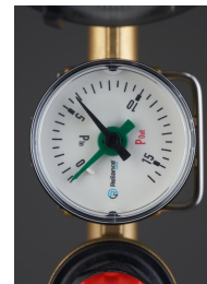
GAGE201001 Dual Reading Gauge