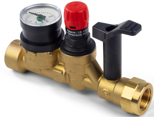
TVAP250050 without insulation cover

WRAS approved for hot and cold water, the valve is suitable for pressures up to 16 bar and temperatures up to 65°C. It is also adjustable between 1.5 - 6.0 bar.