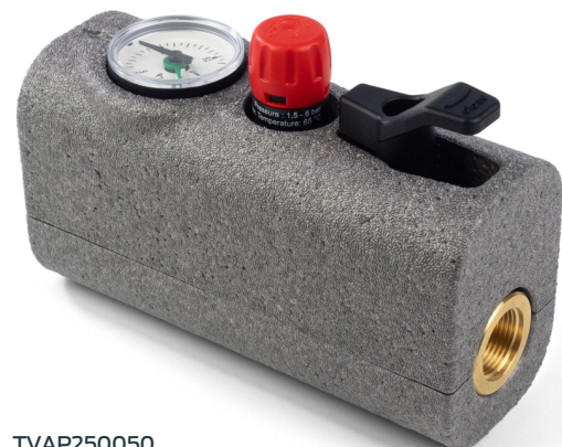
TVAP250050 with insulation cover